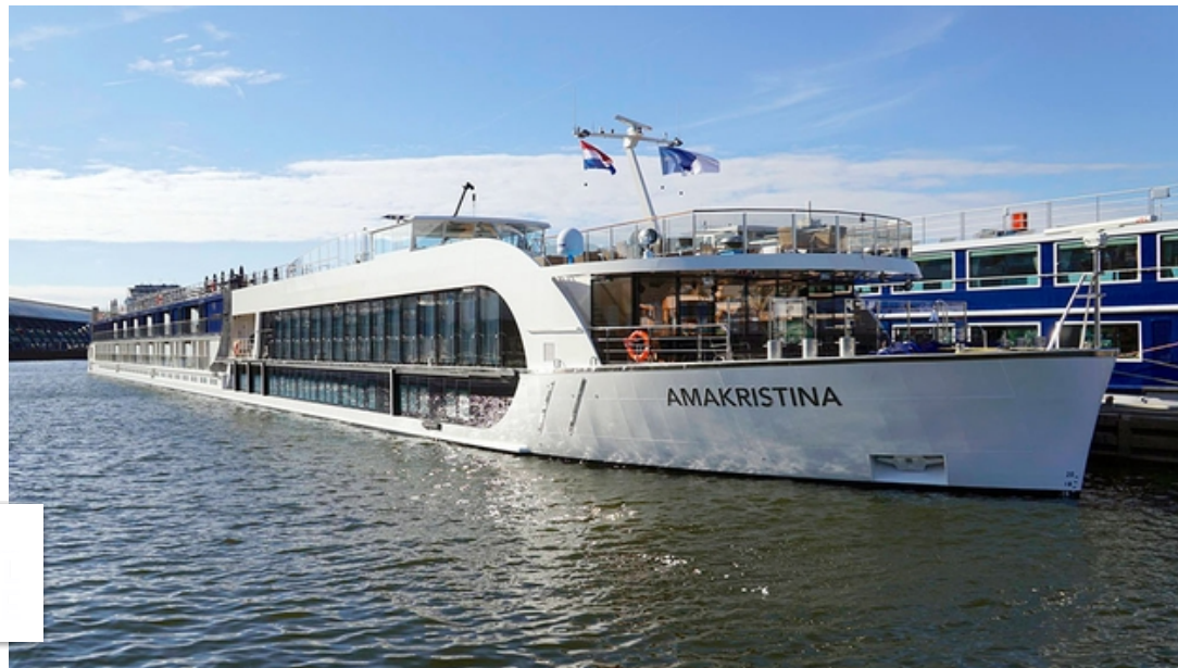
PHOTO: AmaWaterways' AmaKristina in Amsterdam, Netherlands.

CRUISE LINE & CRUISE SHIP | AMAWATERWAYS | JASON LEPPERT | NOVEMBER 18, 2017